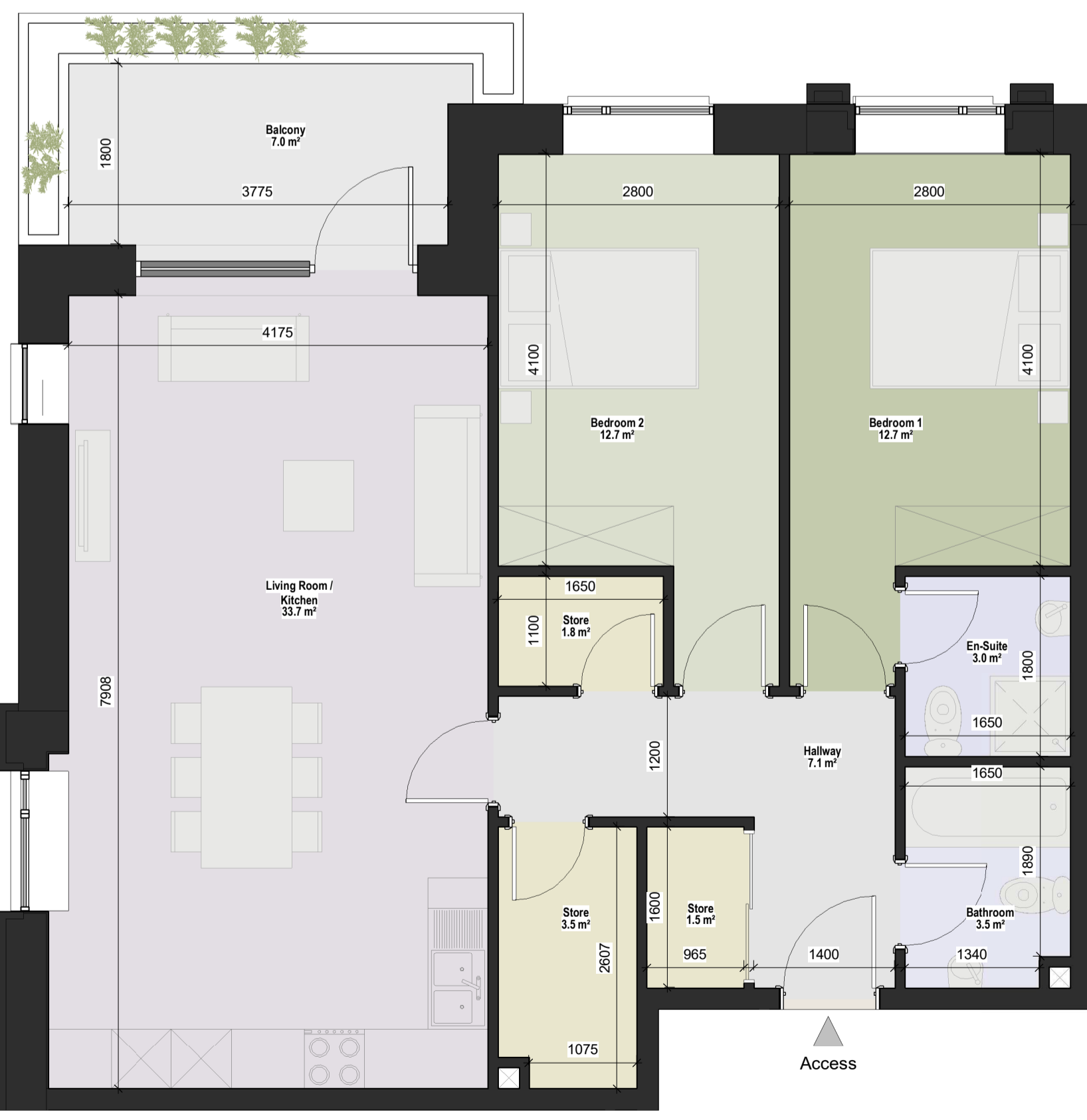
3 Block A & B - Type X 1:50

Drawing BIM Name: PE20057-CWO-ZZ-ZZ-DR-A-2103 CDE Area Suitability Code BIM Revision