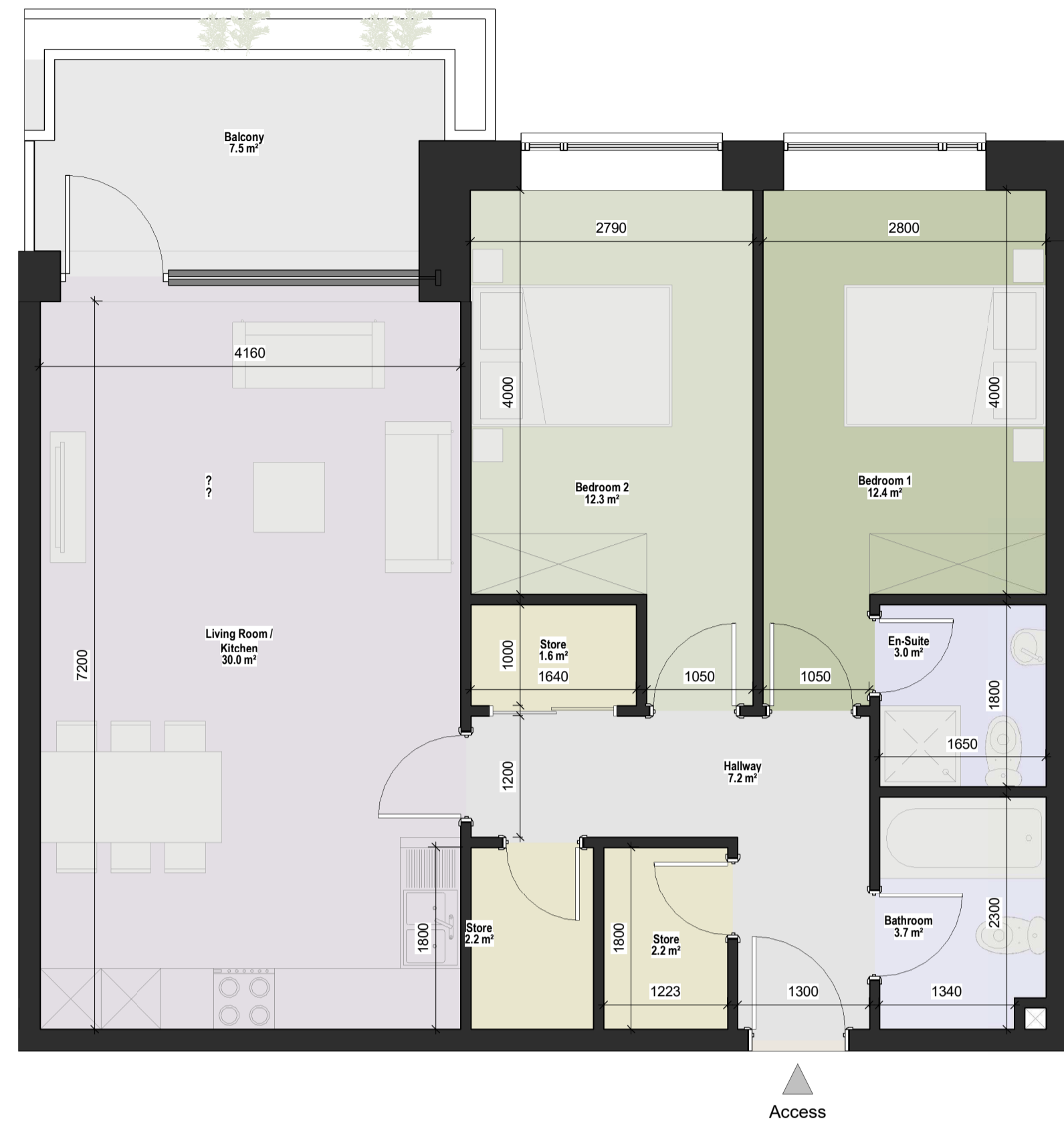
1 Block A & B - Type V 1:50